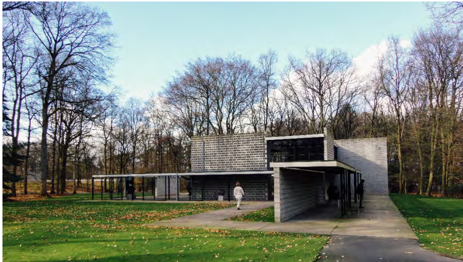
Figure 1. The Rietveld Pavilion.

In 1955, Dutch architect, Gerrit Rietveld, completed a temporary exhibition pavilion for the third international open-air sculpture exhibition in Sonsbeek Park, Arnhem. After fulfilling its short-term purpose, the pavilion was disassembled, and its constituent parts returned to the contractor. 6 Within five years, however, moves were made to reconstruct the building. After a few stalled attempts, a group of architects came together in 1963 to spearhead its reconstruction in honour of Rietveld. 7 Located in the grounds of the Kröller-Müller Museum in Otterlo, the new structure was built on a site chosen by Rietveld himself before his death in 1964. 8 It was opened in 1965 and renamed the “Rietveld Pavilion”, but despite its positive reception and critical success, maintenance issues plagued the project from the beginning. 9 Its condition became so poor that in 2010 the structure was demolished and a new pavilion was built for the third time - a copy of a copy (Figure 1). While some components of the 1965 pavilion were reportedly salvaged and re-used in the new structure, its demolition and replacement with a replica represents a controversial act which occupies a more extreme end of the conservation spectrum. 10