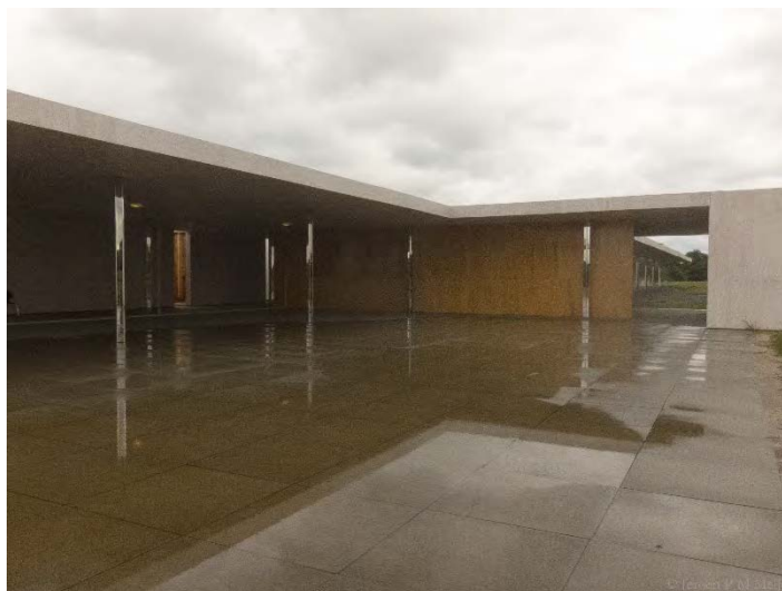
Figure 2. The Mies 1:1 - The Golf Club Project.