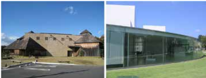
FIGURE 3 "Red" Akino Fuku Museum (1997) by Fujimori and "White" Kanazawa 21st Century Museum (2004) by SANAA (Photos by author)

Fujimori was steeped in tea aesthetics and propelled the sukiya penchant for idiosyncratic invention employing natural palettes, but with rustic ostentation. Modifying Taut's association of ostentation with gilded polychromatic surfaces masking structural logics, Fujimori's ostentation emerged through material richness rather than applique of explicitly rich materials. Expanding Tange's ambition for a creative combination of tradition and invention, Fujimori sought a "barbaric avant-garde" simultaneously evoking vernacular, primitive and craft traditions from across the globe and generating new architecture through natural materials and artful imperfection. 29 Echoing Kurokawa, Fujimori exemplified the decorative principles and splendours of wabi sabi aesthetics.