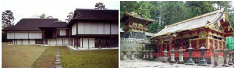
FIGURE 1 Katsura Palace and Nikko Toshogu Shrine

Taut outlined these trajectories, encapsulating a broad swathe of architectural and cultural developments in a reductive diagram that coordinated key archetypal projects. On the one hand he connected the architectonic achievements of Ise through the aesthetics of tea to Katsura while also noting a weakening connection from the rational construction exemplified by Shirakawa farmhouses. On the other hand, he linked Buddhist temple construction through Shogunal architecture, exemplified by a Hideyoshi Toyotomi (1537-1598) castle, to the Nikko Toshogu, which was a Shogunal mausoleum for Ieyasu Tokugawa (1543-1616) and his grandson Iemitsu Tokugawa (1604-1651) who instigated the memorial complex.