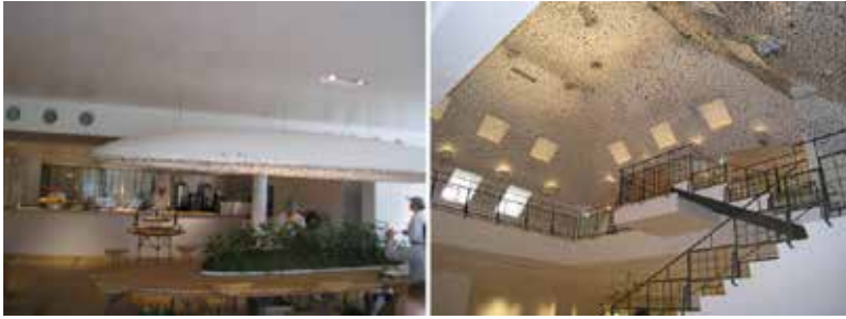
FIGURE 4 La Collina (2015) by Fujimori, simple ostentation

Within an increasingly pluralist context Fujimori promoted particular perspectives deliberately affiliated with Jomon dynamism. 30 Through projects and publications Fujimori reinforced a distinction between ‘White’ associated simplicity and ‘Red’ exuberance, while revealing a vital trajectory in Japanese developments overshadowed by international focus on simplicity stereotypes. 31 Avoiding Tange’s synthesis or Kurokawa’s symbiosis, Fujimori complicated the simplicity of the simplicity ostentation/dichotomy maintaining the opposition while transforming the means and value of ostentation. He incorporated simple natural materials in extravagant ways and celebrated sukiya eclecticism. Fujimori enriched discourse on Japanese architecture by expanding the diversity of recognised manifold forms and weaving new pathways through Taut’s opposed trajectories.