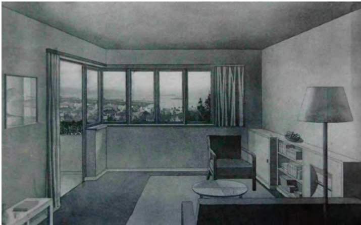
Fig. 1 Interior perspective for Dixon Street Flats, drawn by Ernst Plischke. Private archive, Vienna.

1928/29). The interior also contains inbuilt furniture, as Plischke designed in every one of his houses – here in form of sideboard, bookshelves and inbuilt radiator. In slightly altered form, these were indeed built for the units. Although this is not proof of Plischke’s authorship of the interior design, it points strongly into this direction. 40