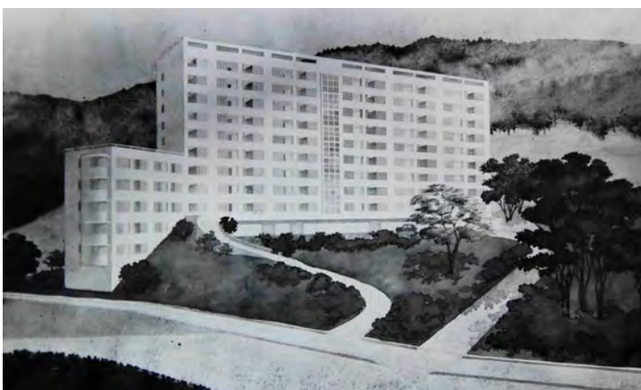
Fig. 2 One of the alternative perspectives for the McLean Flats, drawn by Ernst Plischke.

Two further photos in this folder deserve attention: they show similar perspectival presentation drawings as for the Dixon Street project, but here, the block of flats is more clearly separated into two buildings, one of five stories and the adjacent block of nine stories plus a garage level underneath the main entrance. They are clearly from Plischke’s hand (the way the car is drawn serves as proof). 41 The two drawings represent two variations of the same project; only the form of the balconies differs. One drawing shows them as loggias, whereas the other drawing shows them in form of projecting balconies, grouped in pairs with semi-circular ends. The resemblance of these drawings with the Dixon Street block is striking: both main blocks contain ten stories, both show one main stairway, expressed in a vertical series of glass windows, each separated into nine glass sheets.