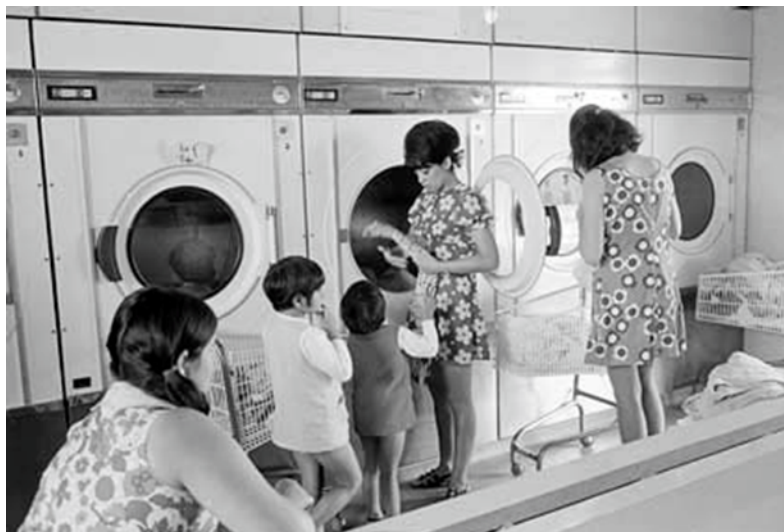
Figure 3. The Endeavour Hostel, Randwick, Sydney: New communal laundry facilities, 1971.

This research was initiated at a time when housing shortage concerns was occupying government at all levels and had arguably contributed in part to the fall of the Federal Labour government in 1949. In the first phases of post-war European migration, there was a political need to reassure voters that incoming migrants would not compete with Australian-born citizens for housing. 23 This experimentation with housing models that can adapt to be reused after the immediate influx of temporary workforces dissipates fits with this political agenda. In the later housing incarnations of hostel experiments such as the Endeavour, these concerns about reassuring the existing Australian-born population about housing competition dissipates in intensity. Instead new concerns emerge about projecting an image of a modern Australia to recruit dwindling migrant numbers from desired countries in Europe. The later projects were undertaken by the Public Works Department in conjunction with both the Department of Labour and National Service and the Department of Immigration. In the administration of these departments it was deemed necessary for the new dwellings to be convenient and comfortable to help project Australia as modern, open and flush with possibility. The negotiation between ideas about what constitutes home and unsettlement can be seen in the architecture, which exhibits design strategies that draw from both the house and the motel.