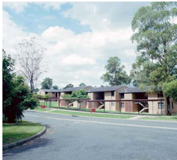
Figure 4. The Endeavour Hostel, Randwick, Sydney: Street view, 1984 Photograph Credit: Department of Immigration and Multicultural and Indigenous Affairs which at the time the photograph was commissioned was titled the Department of Immigration and Ethnic Affairs.

spatial control. Considering this was the selected planning arrangement for purpose-built designs for the resettlement of migrants, it suggests departmental tensions that point to public anxieties around the type of accommodation and it inscribed agendas that should be offered to incoming people in need of accommodation. Apart from the planning similarities to the prison in the use of radial wings and cores, the internal layout of the rooms and their furnishings along with the disjuncture between sleeping quarters and communal everyday living such as eating or laundry suggest spatial configurations seen in the motel. The motel proliferated in Australia in the 1950s and 1960s and was viewed as a wholesome family destination, particularly on a long regional drive away from the city. It represented the benefits of an economically prosperous, modern Australia awash with American convenience that resulted in the ability to undertake independent, family travel. 30 The Endeavour's reference of the motel was to use the utilitarian domestic model to maximise space but the wider cultural suggestions were ideal for use in publications to entice migrants to Australia.