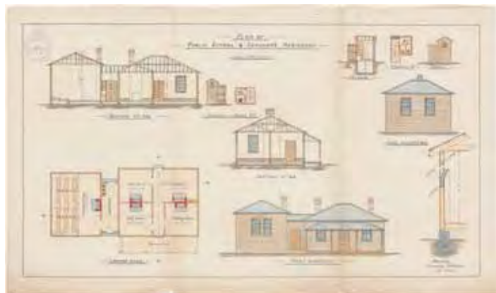
Figure 1. Plan of Public School and Teacher's Residence dated 1883. State Records NSW, Education; NRS 3830, Subject Files 1875-1984, Architect 1876-83, [20/12484], February 5, 1883.