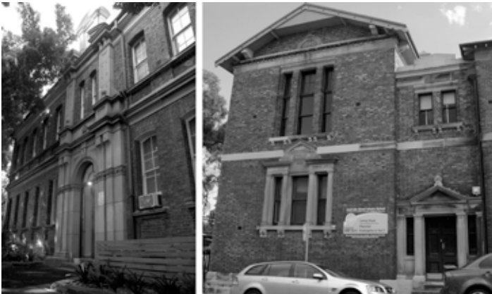
Figure 3. Two schools in the “Simple Classic Style.” (L) Waterloo (R) Australia Street.