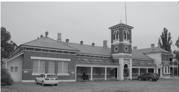
Figure 4: Young Public School designed in 1883 in the “Grand Classic Style.” 3