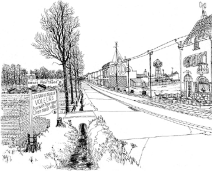
Figure 2. Sketch originally published in Het Lelijkste Land ter Wereld , by Renaat Braem, 1968.

Another important strand in their critiques pertains to urbanism. In Belgium and Australia alike, a pressing deficit in housing presented itself in post-war years. During the depression house building in Australia had decreased significantly and there had been no building for most of the war. As a result, an estimated 300,000 units were needed nationally. 15 In post-war Belgium this deficit was also sharply felt and gauged at 250,000 dwellings. 16 Though it is generally assumed that Europe and Australia responded quite differently to this housing demand, generally associating Australia with the single-family house and Europe with medium- and high-density collective housing, 17 the post-war spatial development of Australia and Belgium was not that dissimilar. In Belgium, much like in Australia, the single-family house was the main typology used to mitigate the post-war housing shortage. 18 This, in combination with the absence of a strong planning policy in either country, led to a comparable urbanization pattern, which obscured the distinction between “city” and “countryside” or “urban” and “rural.”