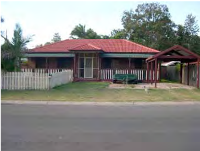
Figure 4. View of a typical Gold Coast residential landscape, Circa 1990s.