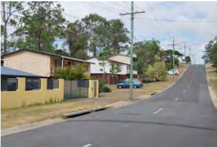
Figure 3. View of a typical Gold Coast residential landscape, Circa 1980s.

From the 1930s domestic tourism in Australia was stimulated by the prosperity of a modernising economy and a growing cultural attachment to the outdoors and the beach in particular. The Gold Coast benefited from these trends which bolstered land speculation in the area. A group of developers with shady reputations, who became known as the “white shoe brigade,” 8 tapped into Australia’s post-war prosperity feeding a desire for every Australian to have a holiday house by the beach. This trend towards second homeownership stimulated the development of construction industries and property services and secured the Gold Coast’s property boom. By the end of the 1959 financial year the value of Gold Coast building approvals was reported in The South Coast Bulletin , March 16, 1959, as being an Australian record and the city has held this position almost consistently