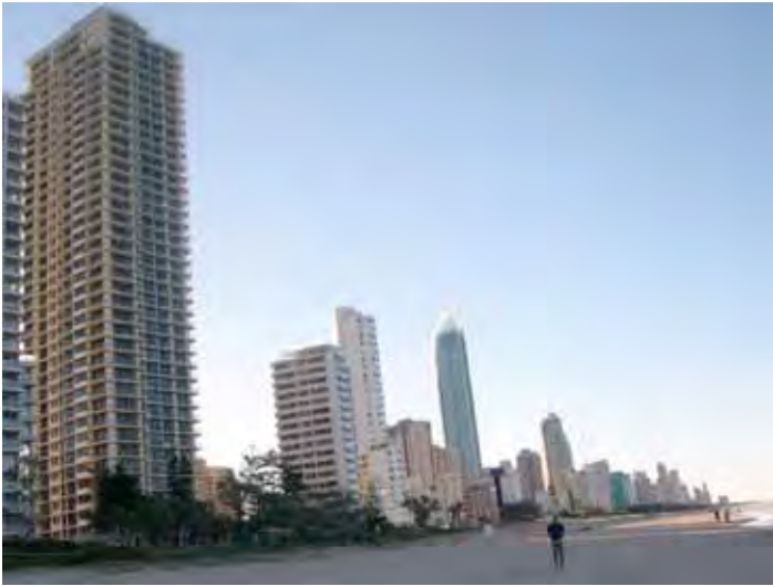
Figure 2. View of the Gold Coast City tourist landscapes, Circa 2007.