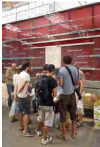
Figure 4. (L) Memorial plaques at the wall of Markale Market Hall