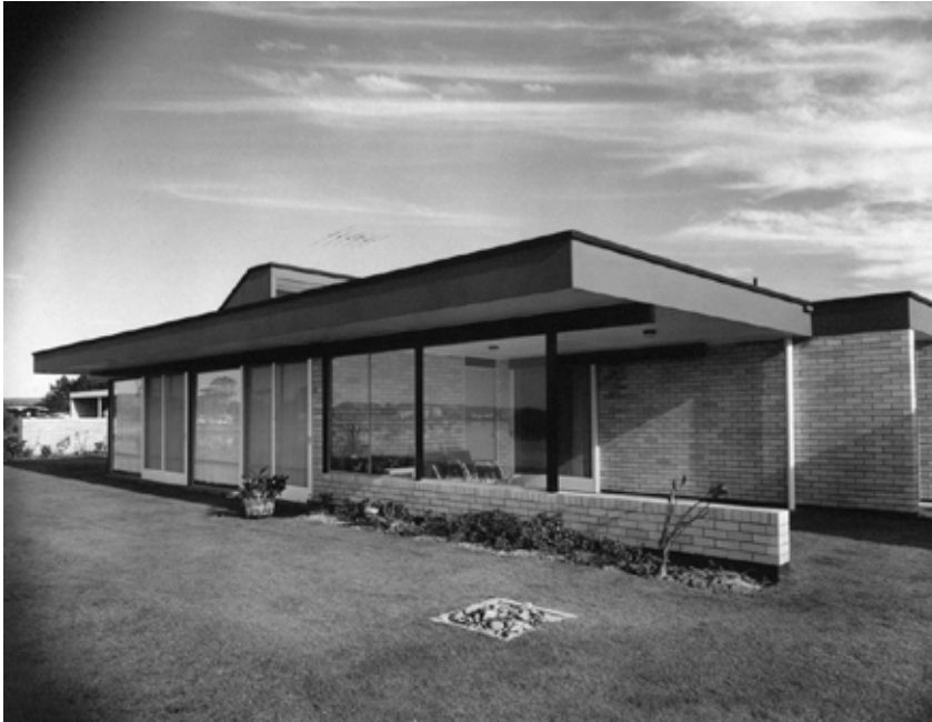
FIGURE 1 “House of the Year,” Gold Coast Bulletin, 1965.