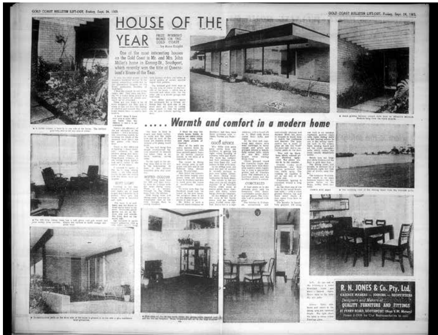
FIGURE 2 Miller House, Southport (1964).