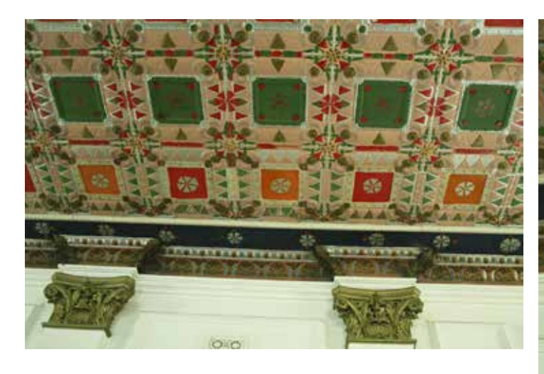
FIGURE 9 Pressed metal ceiling, Perth Mosque, 2015. (Photograph by author).

Compelling indications of a direct and informed transfer of this late Mughal design and building tradition to early twentieth-century Australia can be observed in the interior decorative features of the Perth mosque. Mughal interiors often exhibit the application of rich, colourful ornamentation (particularly in geometric compositions), especially in the execution of cornices and ceiling planes in contrast to the more subdued wall planes which continue the orthogonal compartmentalisation of the exterior façade. In Perth, colour is applied to painted interior mouldings, the gilt-tipped niche [Fig 8], the ornate cornice, and the geometric pressed metal ceiling [Fig 9 and Fig 10], a combination which is depicted in the study of Ahmad Shah Duran's audience hall mentioned above. While these comparisons require further study, the parallels are substantial enough to suggest emulation of The Last Afghan Empire. As such, the intent to design a mosque which emulates the Mughal architecture of the Indian subcontinent, with its prominent iwan (of sorts) which engages with the city, is a significant expression of a proud architectural heritage and a statement of confidence for this pioneering migrant community in the early 1900s.<sup>48</sup>