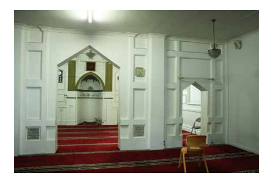
FIGURE 8 View toward mihrab niche, Perth Mosque, 2015.

Compelling indications of a direct and informed transfer of this late Mughal design and building tradition to early twentieth-century Australia can be observed in the interior decorative features of the Perth mosque. Mughal interiors often exhibit the application of rich, colourful ornamentation (particularly in geometric compositions), especially in the execution of cornices and ceiling planes in contrast to the more subdued wall planes which continue the orthogonal compartmentalisation of the exterior façade. In Perth, colour is applied to painted interior mouldings, the gilt-tipped niche [Fig 8], the ornate cornice, and the geometric pressed metal ceiling [Fig 9 and Fig 10], a combination which is depicted in the study of Ahmad Shah Duran's audience hall mentioned above. While these comparisons require further study, the parallels are substantial enough to suggest emulation of The Last Afghan Empire. As such, the intent to design a mosque which emulates the Mughal architecture of the Indian subcontinent, with its prominent iwan (of sorts) which engages with the city, is a significant expression of a proud architectural heritage and a statement of confidence for this pioneering migrant community in the early 1900s.<sup>48</sup>